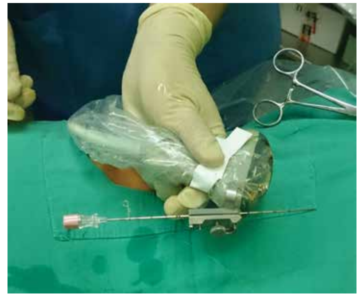
Figure 2. Ultrasound-guided needle aspiration system

when the cyst size decreased (p=0.01). However, this relationship was not detected in lower and middle pole cysts (p=0.9 and p=0.587, respectively).