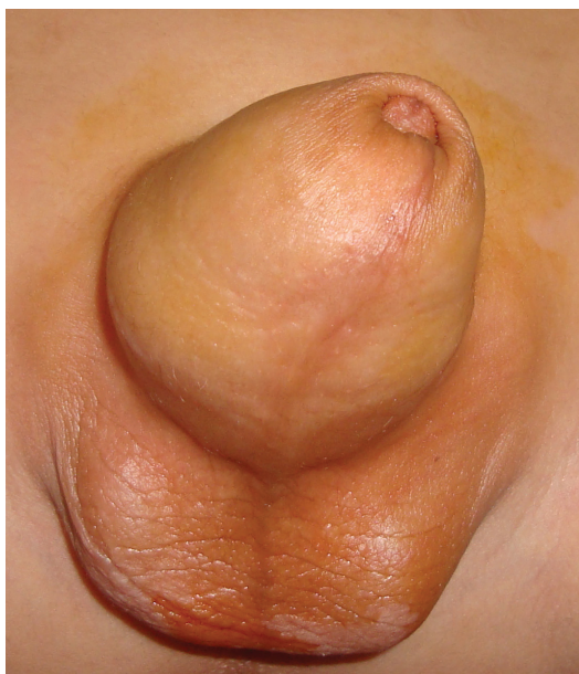
Figure 1. There is a swelling extending to the scrotum in the ventral aspect of the penis due to the urethral diverticulum

with a midline incision at the penoscrotal junction. The giant diverticulum was extending from the coronal region to the middle of the scrotum and was surrounding the ventral half of the penis body (Figure 3). The diverticulum was dissected from the surrounding tissue adhesions and was opened from its anterior aspect. A narrow stalk connection to the coronal part of the urethra was detected. Diverticulectomy was performed and the defect in the urethra was repaired with two layers. No intra- and post-operative complications occurred. The urinary