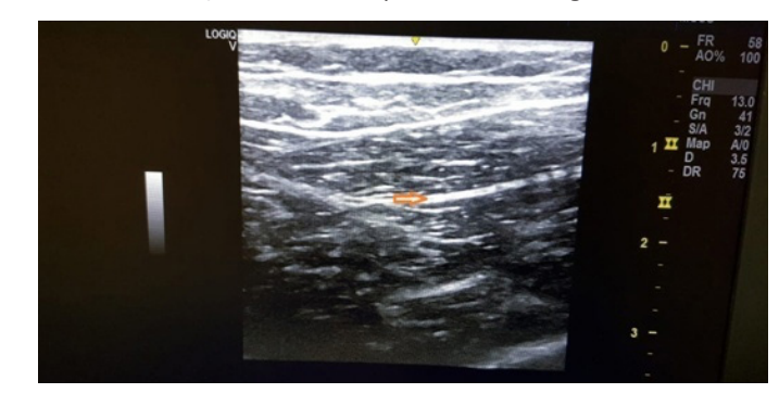
Figure 2. Obturator nerve with US US: Ultrasonography

The files of 81 patients were reviewed retrospectively. We did not find any significant differences between the groups in terms of age, gender, American Society of Anesthesiologists (ASA), length of hospital stay, postoperative bleeding and mortality for 30 days (p>0.05) (Table 1). Although the mean age of the patients was 69.49 years ( \pm 11), there were 75 (92.6%) male patients. The tumor sizes of 32 (39.5%) patients were found to be smaller than 3 cm, whereas they were larger than 3 cm in 49 (60.5%) patients. Most patients (70.4%) had a smoking habit. Generally, 28.4% of the patients had lung diseases (COPD,