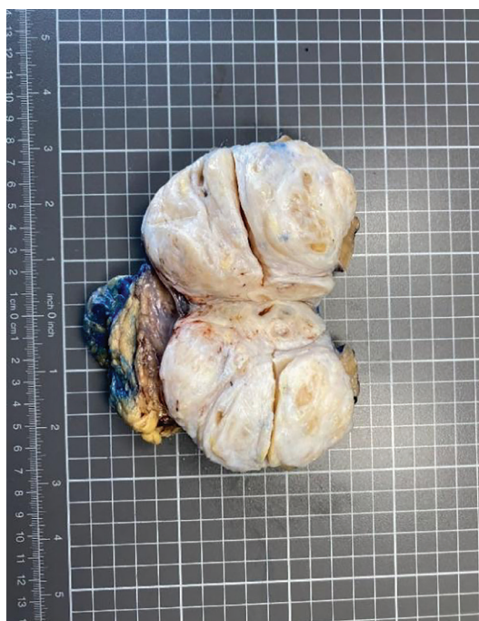
Figure 2. Partial nephrectomy specimen showing a predominantly solid mass with microcystic areas

After surgery, the pathologic examination, revealed negative surgical margins. No invasion was observed in the renal pelvis or hilar blood vessels. There were no complications during the surgery or in the recovery period. The pathology report of a 14x8.5x5 cm mass indicated as MEST (Figure 2). The pathological evaluation of the mass lesion showed smooth muscle bundles, adipose tissue lobes, and thick-walled blood vessels in a hypocellular stroma with hyalinized and myxoid features. Multiple areas contained tubule structures and epithelial cysts of various sizes. The solid portion of the mass was composed