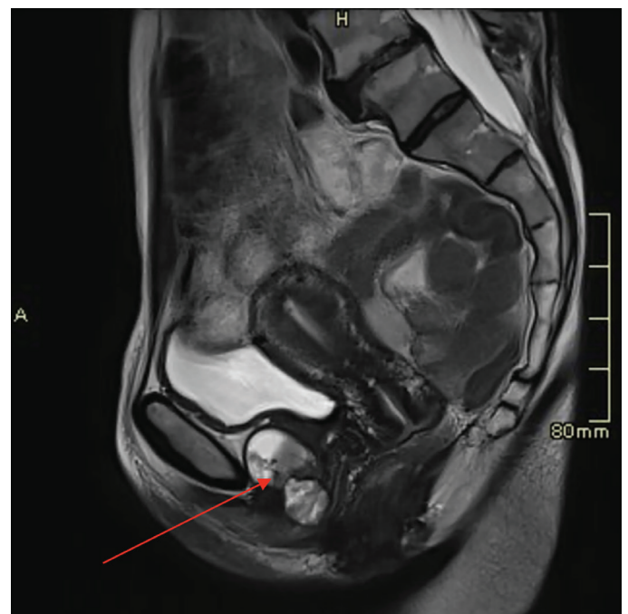
Figure 2. Sagittal plane of the urethral diverticula